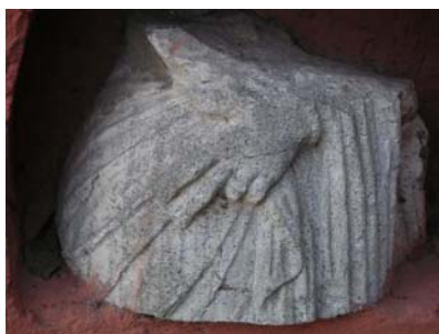
A guardian at the door