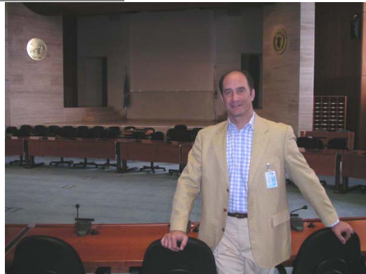
AT THE UN'S WFP