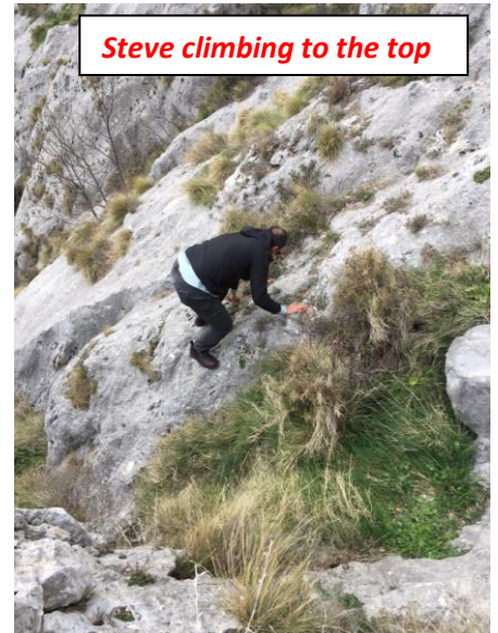
Steve climbing to the top

"holes" dug unto the rocks. Those were "housing units" for the hermits that occupied the area around 500 AD . An awesome place to contemplate God's grandiose creation!